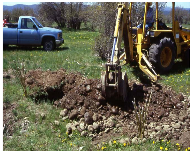
1 Cluster planting in Goose Creek, ID with a small backhoe supplied and operated by the landowner

For fine textured soils, the Waterjet is the best tool we have found for planting unrooted hardwood cuttings. It is fast and efficient. It hydrodrills a hole with water which liquefies the