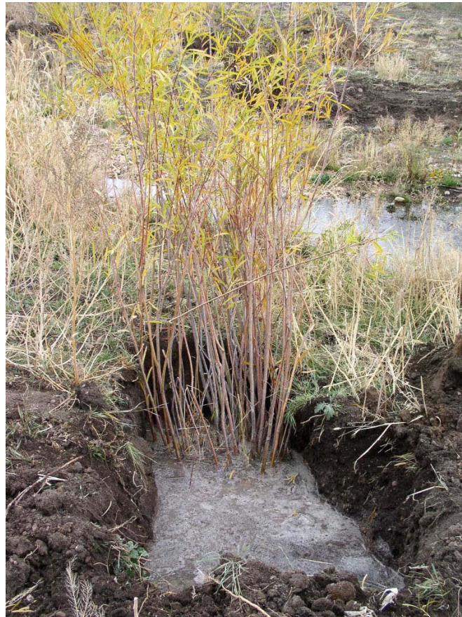
Willow cuttings placed in the hole before they are cut off. Note: cuttings were harvested too early so ignore the leaves.

Once the hole is complete and into the water table, place 3-5 unrooted cuttings that are long enough to reach about 1 foot into the water table and that will stick about 1-3 feet above the ground, in the hole. The height of the cutting above the ground will depend on the height of the competing vegetation that surrounds the hole and the depth of the water during runoff. The above ground portion of the cuttings need to be above the shade generated by competing vegetation and tall enough to be sticking out of the water during high water runoff events. Don't cut off any excess material until after planting the cutting to ensure the cutting is not too short.