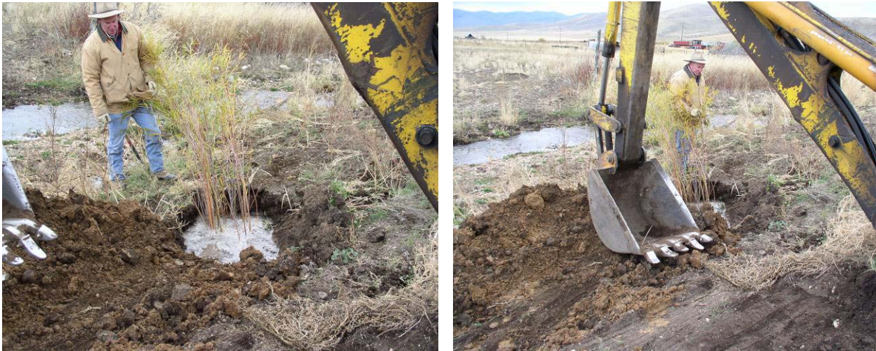
Willow placed in cluster planting hole. Backhoe pushes top soil into the hole. Water in the hole is from the backhoe pouring it in. Leaves on the willows should have been harvested after the leaves had fallen off.

Once the cuttings are in the hole, have the backhoe push some of the top soil back in around the cuttings. Pushing the top soil into the hole should be alternated with dumping buckets full of water in the hole. This will help the soil settle around the cutting and helps eliminate air pockets which result in good soil to stem contact which increases root growth.